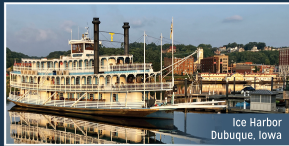
Ice Harbor Dubuque, Iowa

Our 2-Day Cruise departs and returns to LeClaire, Iowa, just north of the Quad Cities. This charming, historic rivertown is home to the American Pickers; plus, great shops, dining, antiques, a brewery, a distillery, the Lone Star steamer & Buffalo Bill Museum.