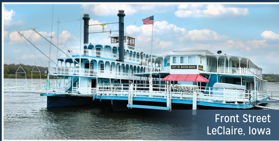
Front Street LeClaire, Iowa

2-DAY OVERNIGHT DESTINATION & 1-DAY CRUISE DEPARTURE